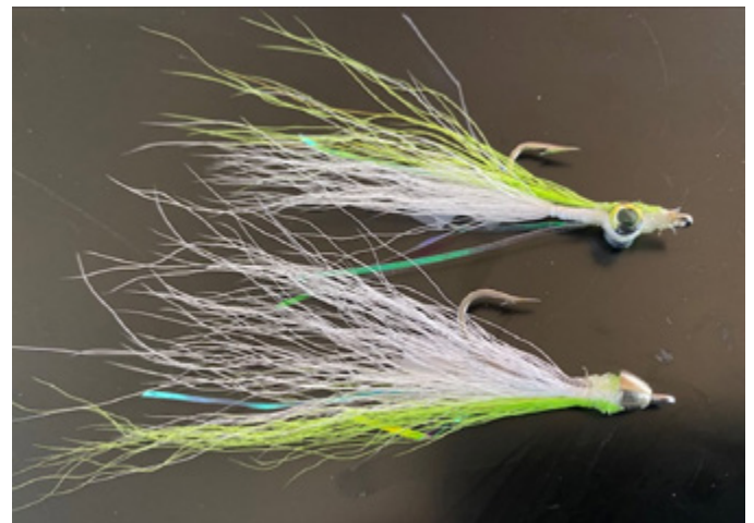
The flies: Clauser Minnow (top), Conehead (bottom).

The double-fly rig using a 3-way swivel: heavier Conehead on bottom, lighter Clauser Minnow on top.