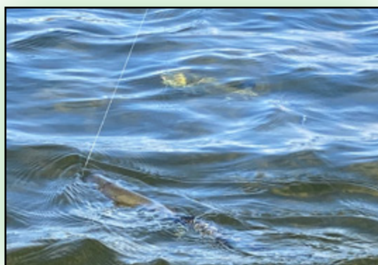
Ladyfish two-a-time, see Page 4 .

We need to update the membership's phone numbers and email addresses.