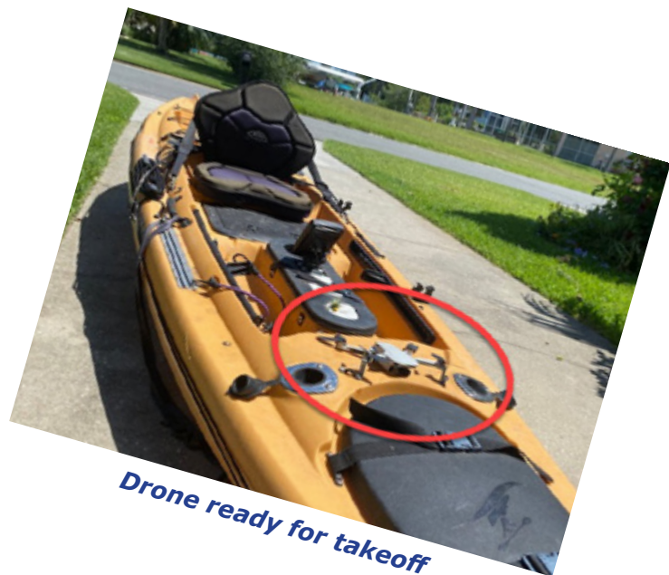
Drone ready for takeoff