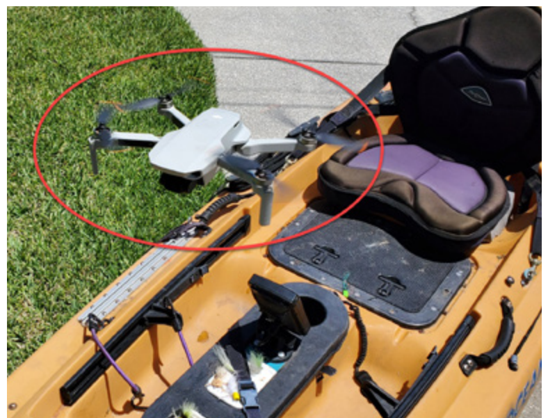
Drone is airborne from aircraft carrier kayak