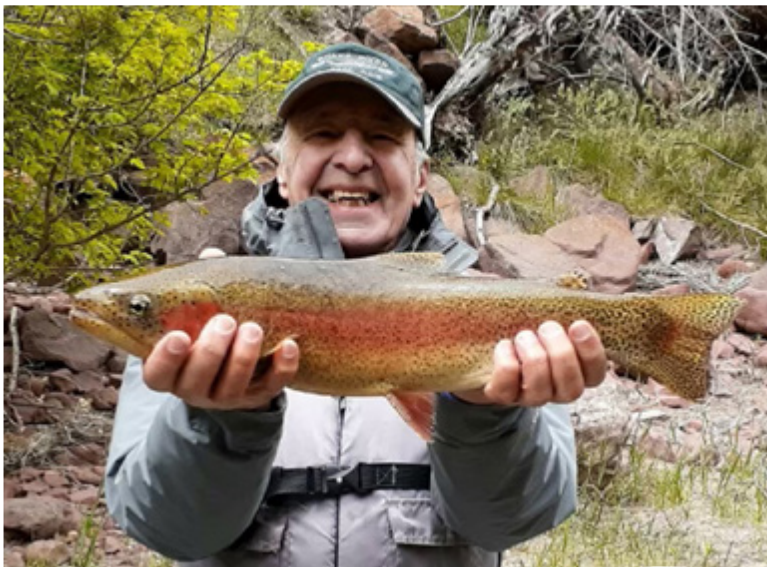
One beautiful Rainbow