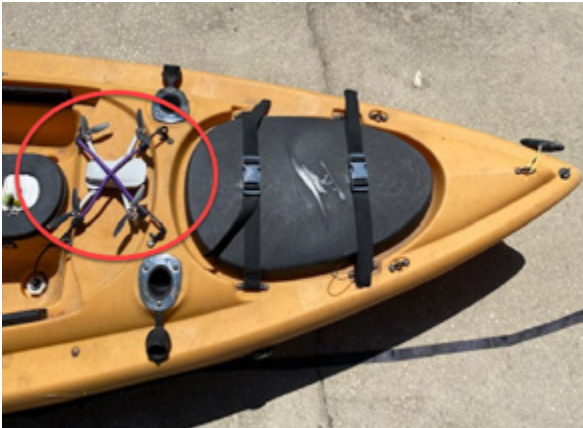
Safe and secure, Fishing Drone is lashed to kayak