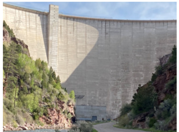
Flaming Gorge Dam (below Flaming Gorge Reservoir). The Green River starts below the dam.