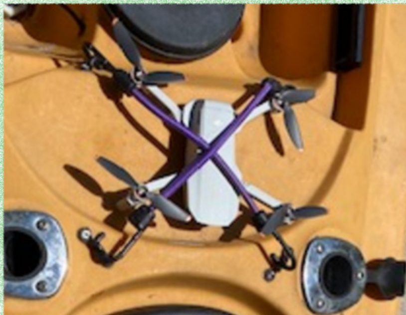
See the Kayak Drone Experiment, page 3