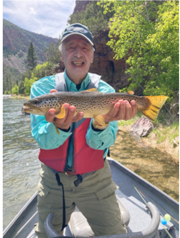
A lovely western Brown Trout