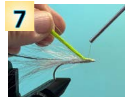
7 Tie on the green bucktail body. It should extend a little past the white bucktail body.