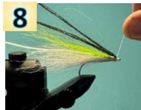
8 Tie on two strands of Peacock Herl.