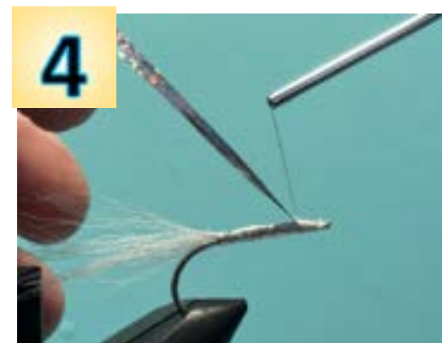
4 To create the Deceiver's silver body, wrap the silver crystal flash forward to the hook eye and tie down.