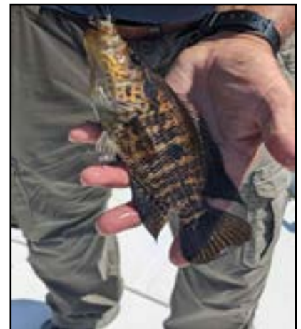
A nice Jaguar Guapote. See the Alligator Alley Trip p. 8.

Tarpon have begun their annual migration up the Nature Coast and if you're interested in hooking one of these legendary Megalops, TCFF's local guides