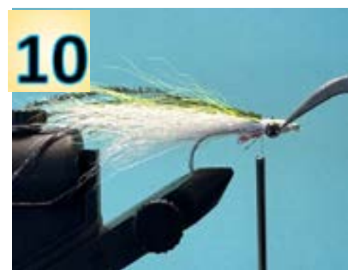
10 Add the glue-on eyes.