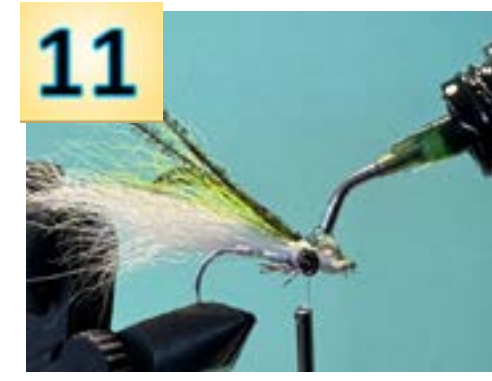
11 Drip thick head cement between the eyes, top and bottom, to create the Deceiver's head.