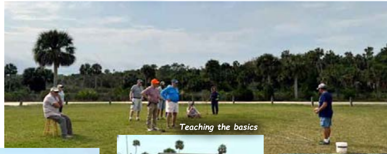
Teaching the basics