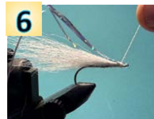
6 Tie on two strands of silver crystal flash near the hook eye. Crystal flash should extend past the tail.