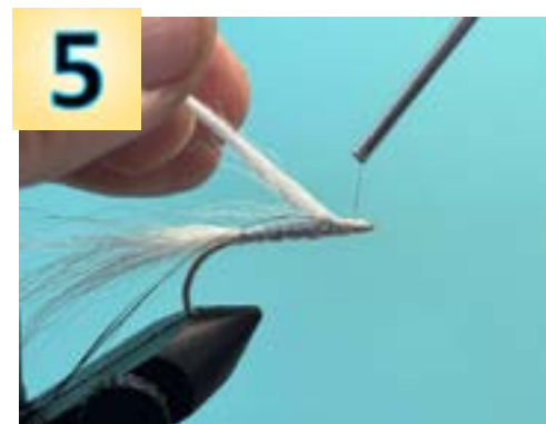
5 Tie on the Deceiver's white bucktail body near the hook eye. Body should extend past tail.