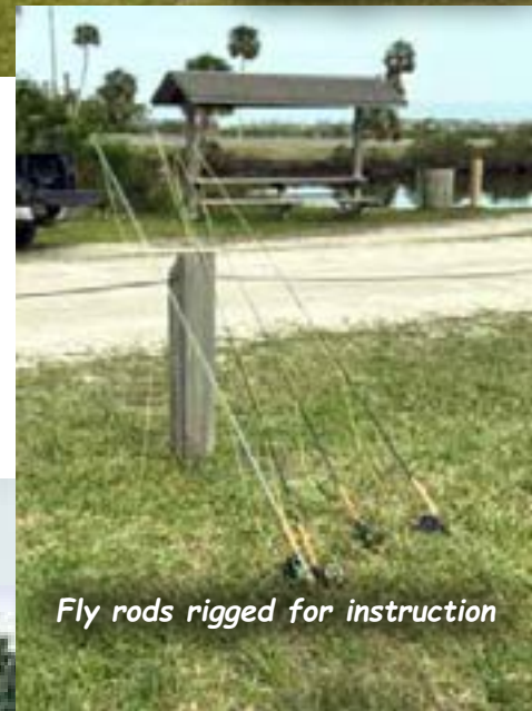
Fly rods rigged for instruction