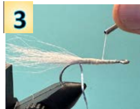
3 Tie on the Deceiver's tail using white bucktail (on top of the silver crystal flash).

Fishing the Bucktail Deceiver Cast it over weed beds and let it sink to the desired depth but keep it above the weeds. Pull it through the water with short jerks.