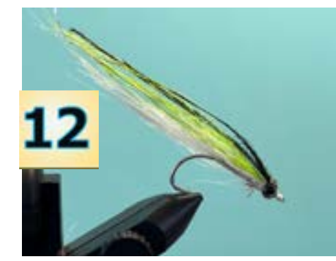
12 The finished product.