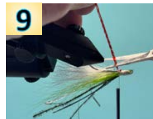
9 Turn the fly upside down and tie on the gills (red crystal flash). Trim to approximately 1/4".