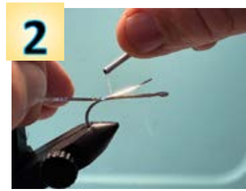
2 Near the hook bend, tie on the silver crystal flash. You'll wrap the silver flash forward to the hook's eye once you tie on the tail.